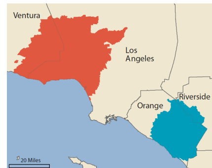
Areas of concern in California for invasive breast cancer among women